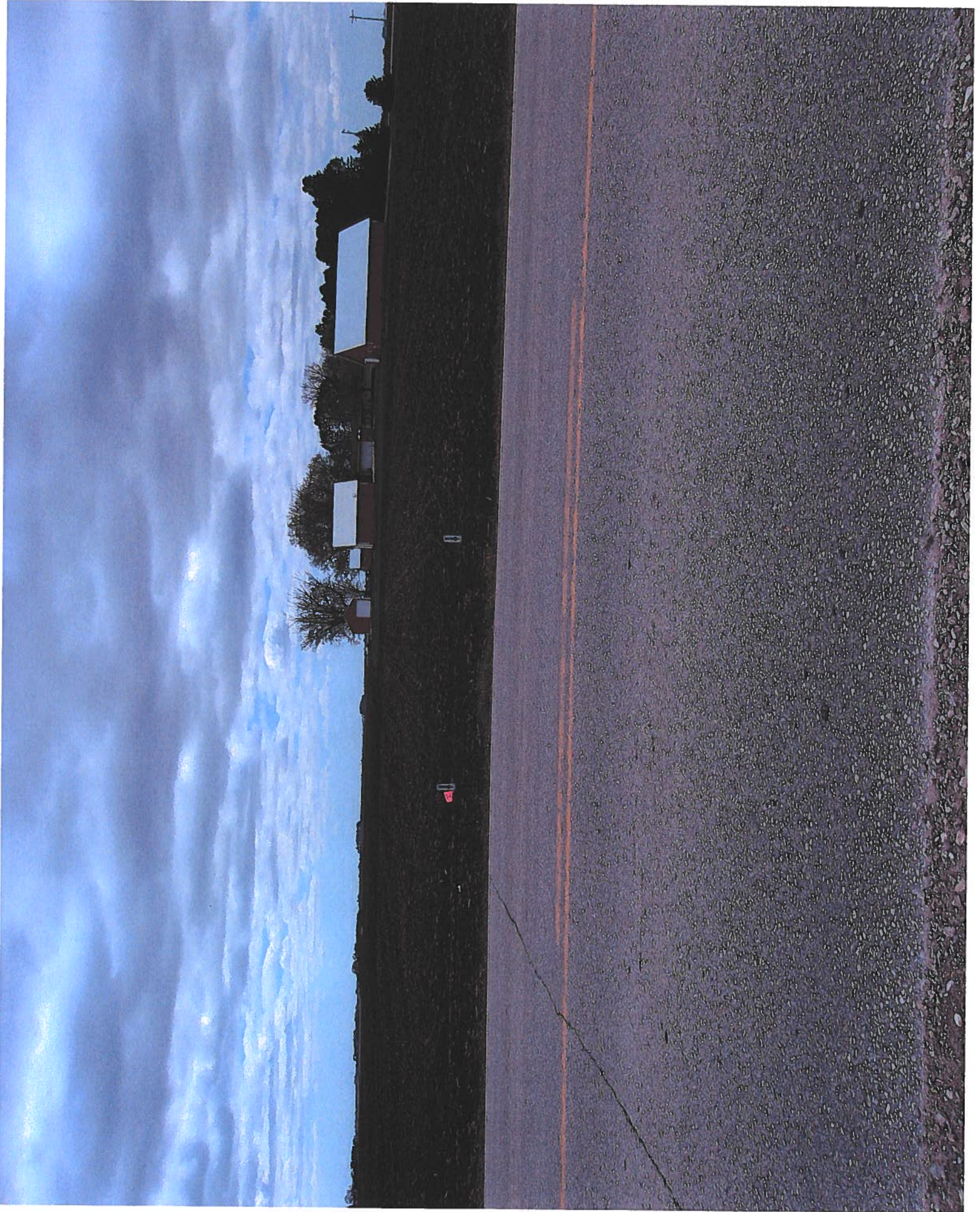
LOOKING WEST OVER S27 ON LATZ