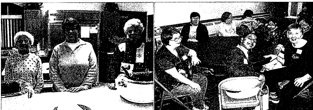
Volunteers provided a wonderful soup supper for the FIA Christmas. Attendees get ready for fun at the East Ladies party.